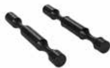
WC602900B Matte Black