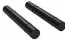
WC500900B Matte Black