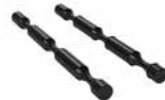
WC603900B Matte Black